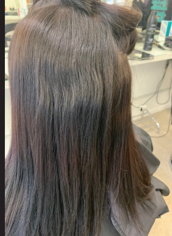
AFTER - Blow dry only